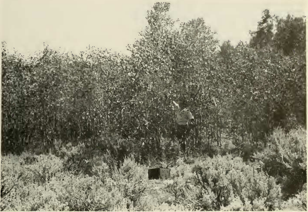
Fig. 2 continued: C, site 3.

fication, the site quality would be site IV for all three areas, which is a poor site with little chance of producing aspen wood products other than firewood.